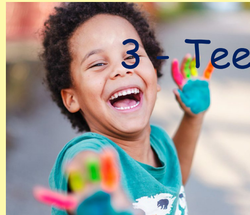
3 - Teenager