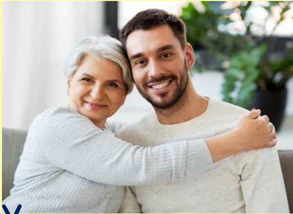
1 - Baby

Let's put these pictures in the correct sequence to show the human life cycle.