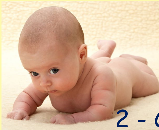
2 - Child