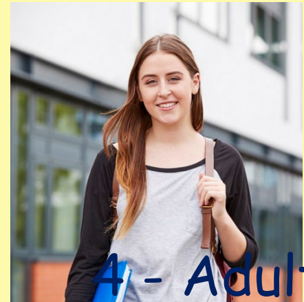
4 - Adult