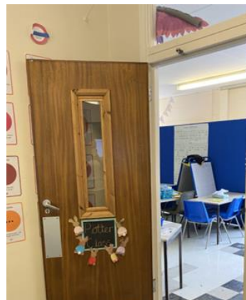
Door to corridor