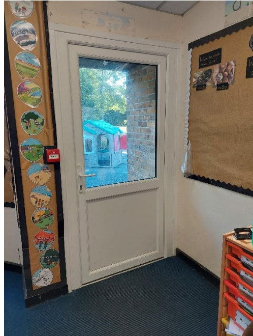
Door to playground