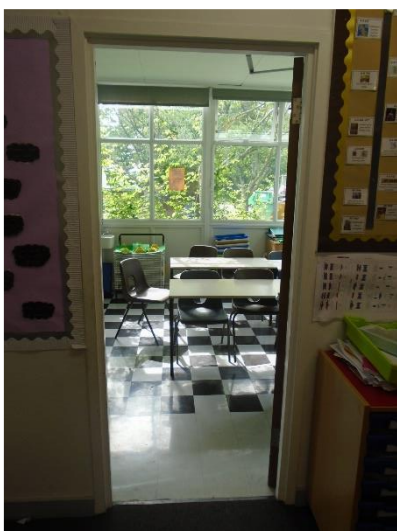
Door to corridor